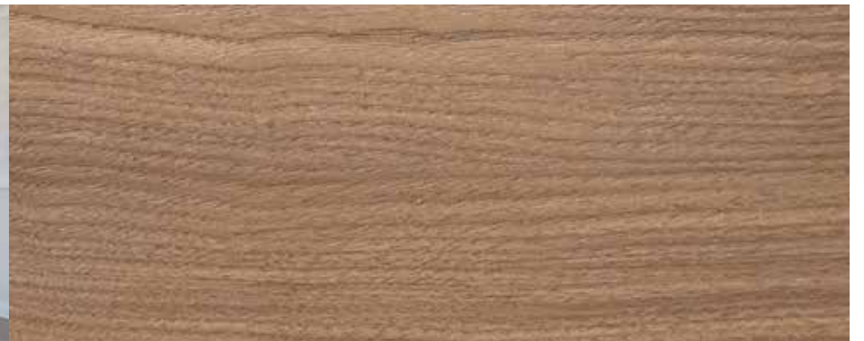
TORNADO OAK #FPC-786