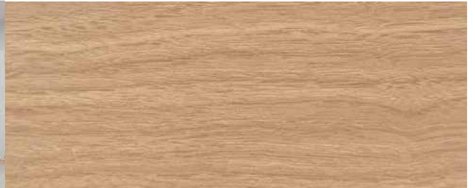
ROCKFORD OAK #FPC-785