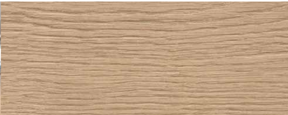
PEWTER OAK #FPC-782