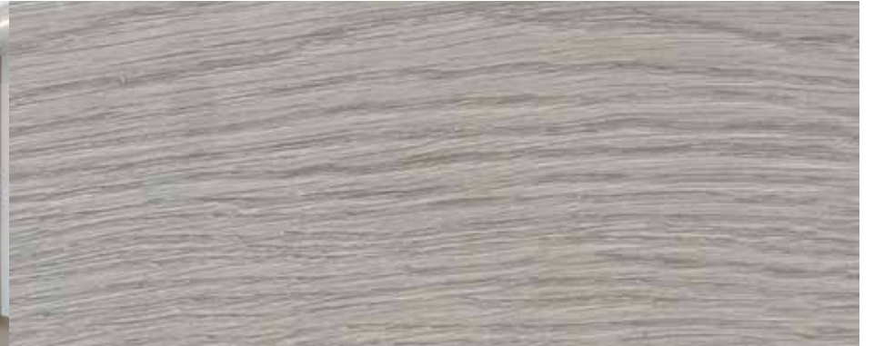
SUMMER OAK LIGHT GREY #FPC-783