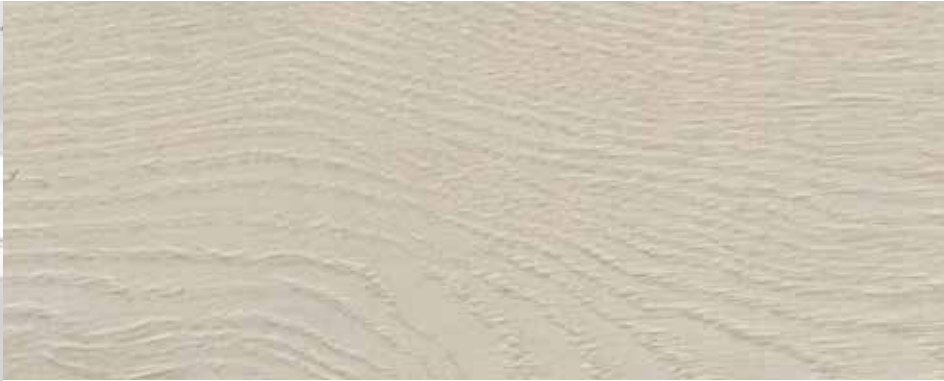
SPRING OAK BEIGE #FPC-780