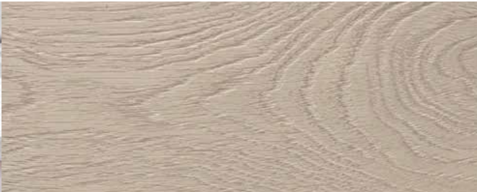
FINLAY OAK GREY #FPC-781